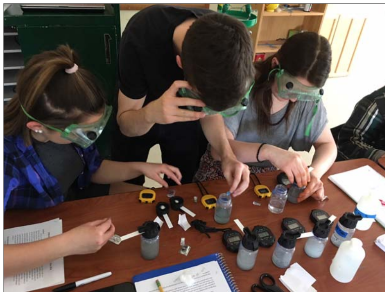
Counter clockwise from top left:

Arsenic Testing Kits; measuring concentrations; running tests.