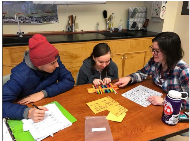
Students working in groups to complete a simulation to understand the process of transcription and translation.