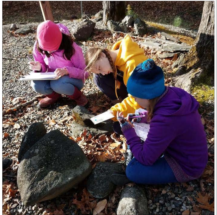
Right: How can we read the rocks in order to learn what forces and events shaped our local topography? We practiced our rock identification skills at the GCC rock park to learn how.