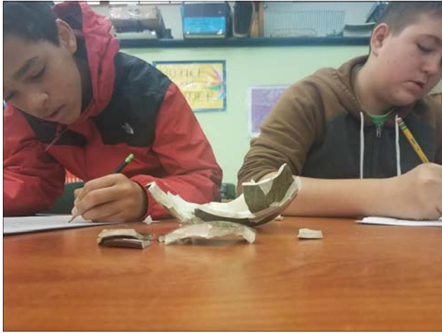
Left: In science we tried our hand at the archaeology skill of mending pottery in order to make inferences about the shape and use of vessels.

Since October, the 7th graders have been considering the question HOW DO WE LEARN WHAT HAPPENED BEFORE WE WERE HERE? , honing their powers of observation and learning how to support inferences with evidence. We'll be working toward some culminating projects and products as the semester and expedition draw to a close. Stay tuned to see how these historians and scientists use their storytelling skills to show you all they've discovered!