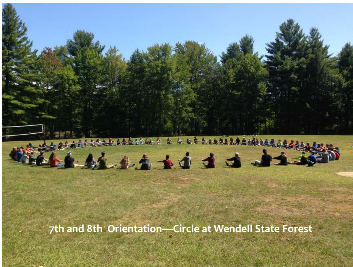
7th and 8th Orientation—Circle at Wendell State Forest