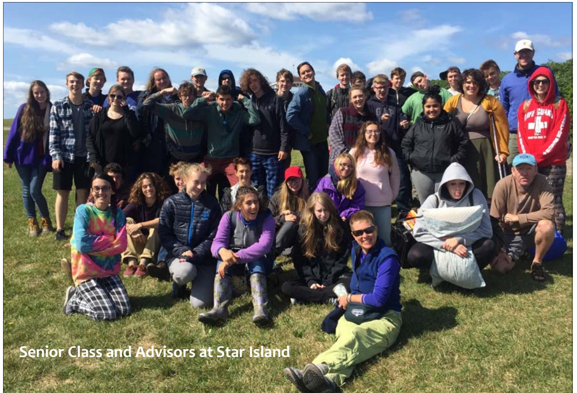
Senior Class and Advisors at Star Island

In English, students have been writing college essays. Math has begun with an independent statistics research project.